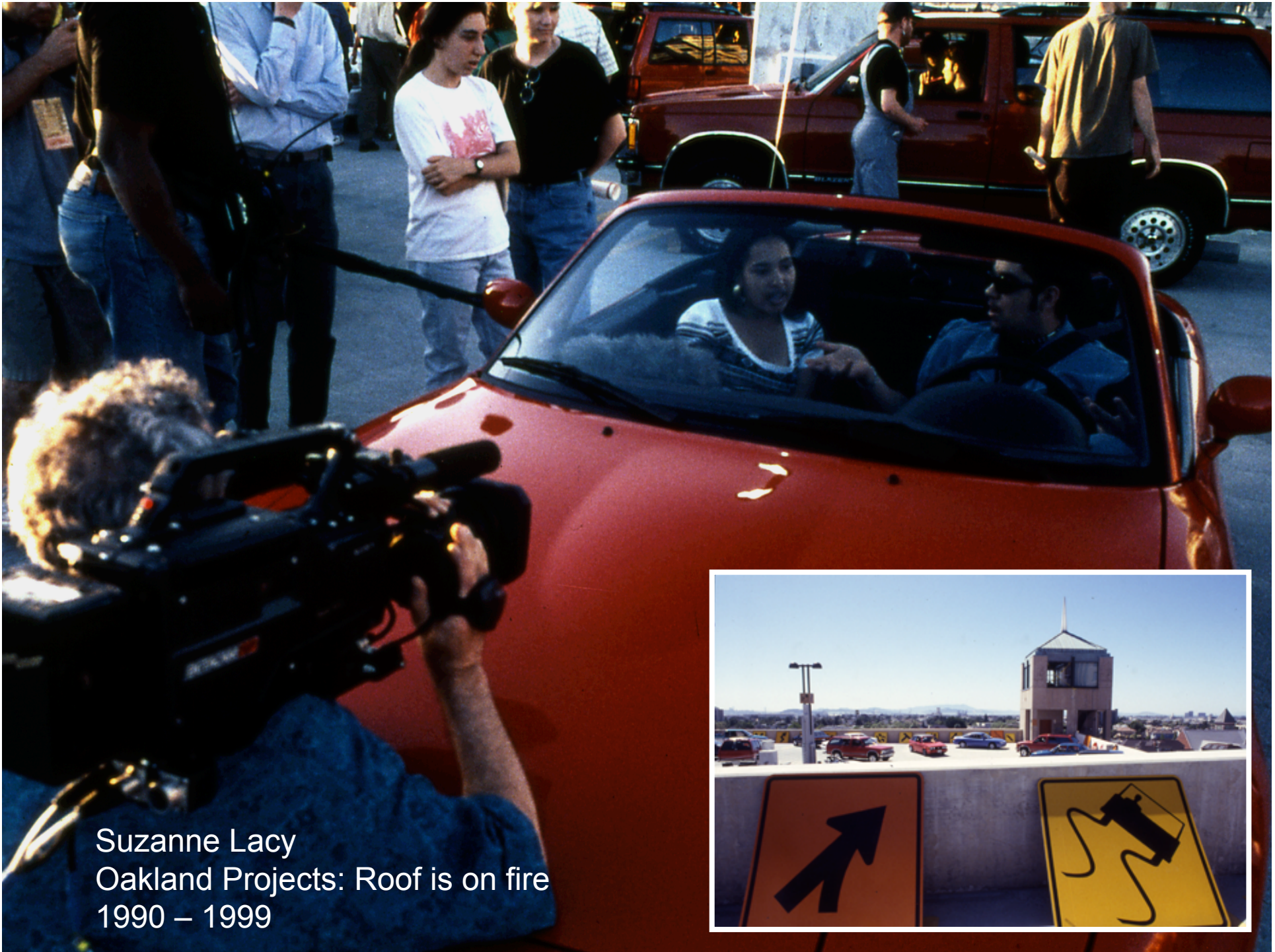
Suzanne Lacy Oakland Projects: Roof is on fire 1990 – 1999