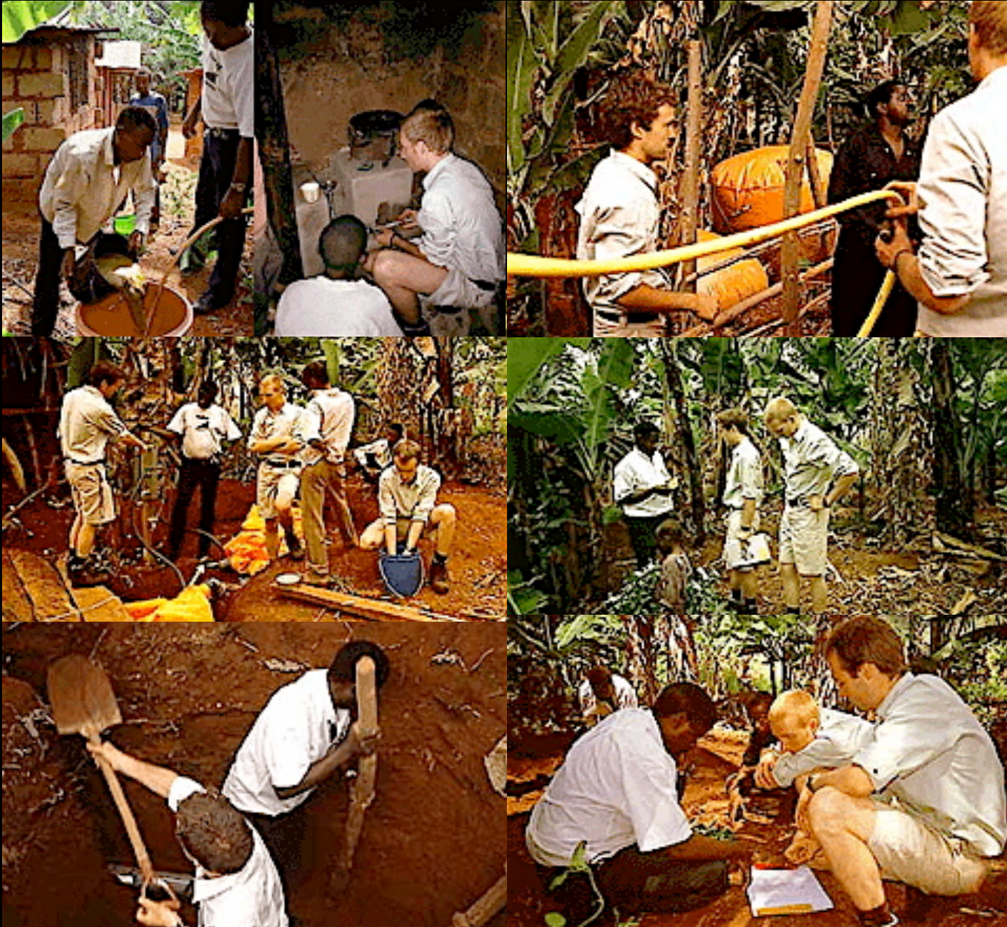
Bio-Gas, Superflex, Tanzania, Africa (2002 – ongoing)