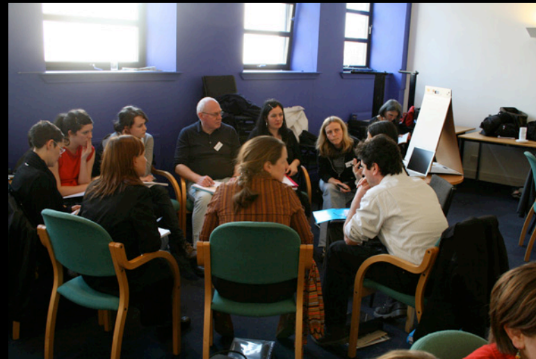
Seminar 1 Aesthetics and Ethics of Working in Public 27 & 28 March, 2007 Aberdeen