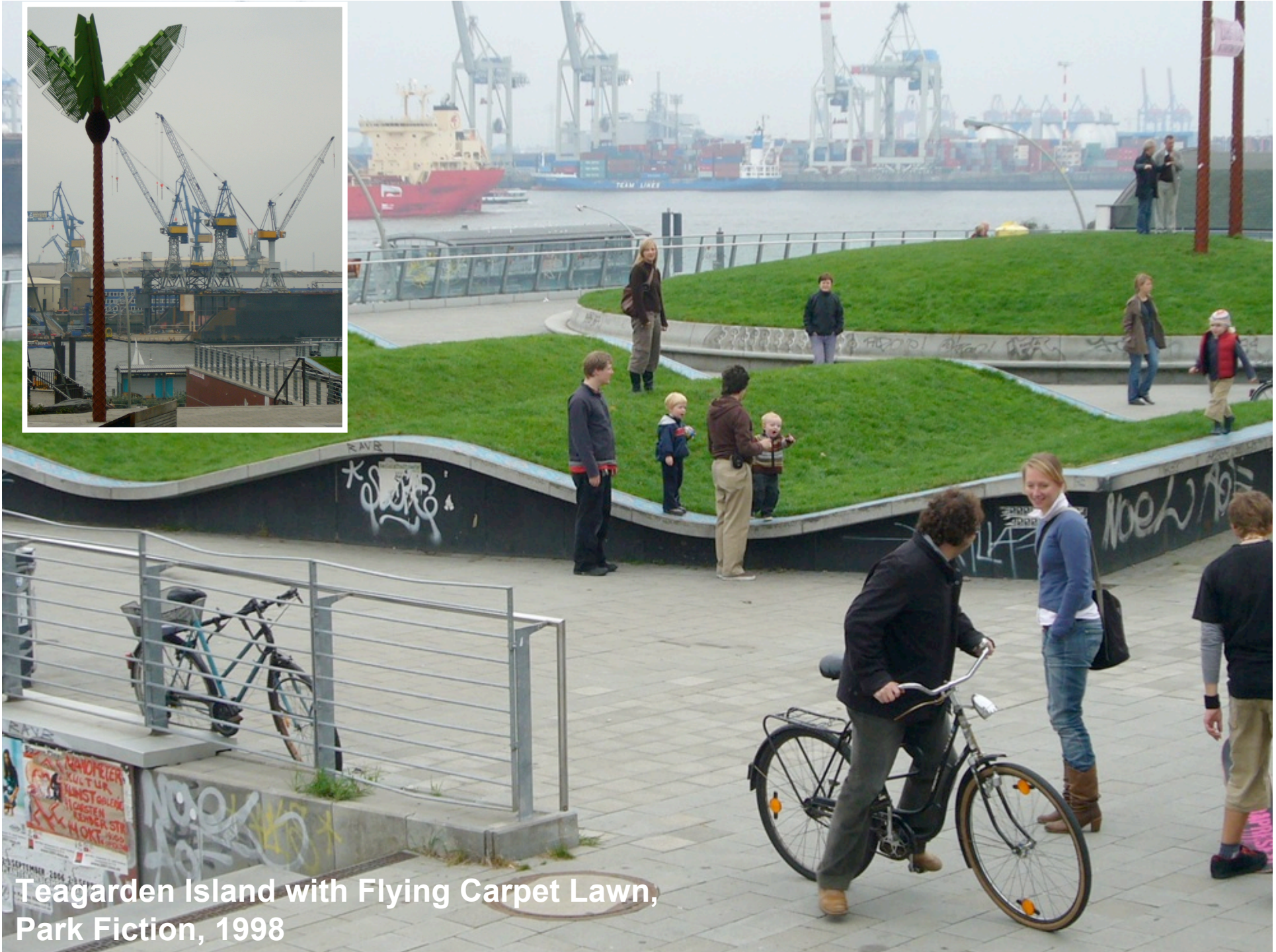
Teagarden Island with Flying Carpet Lawn, Park Fiction, 1998