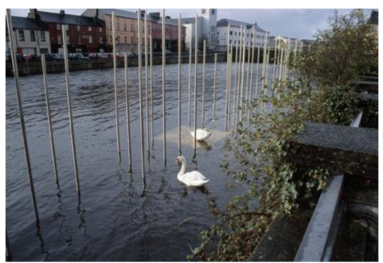
Figure 4 Lines/Plane: Larus/Cygnus

It is that primacy of drawing as well – the simplicity of the drawing act I like. Some of the drawings may end up as three-dimensional manifestations and could be more accurately described as sculptures, An Enlightened Stand , for example.— I'm thinking particularly in this instance of a drawing I made in Sligo in Ireland, Lines/Plane : Larus/Cygnus <sup>iv</sup>, which is made of stainless-steel rods and projects out of the river. It's was a huge engineering project which involved damming the river – so when I talk about the simplicity of drawing it is more the simplicity of the concept – it is not always the simplicity of the execution. The reductive act of translating a landscape to a drawing – to the drawn form – is where, I think, the simplicity lies.