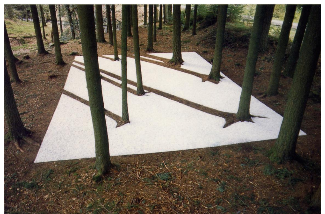
Figure 3 An Enlightened Stand

Returning to your original question, if I had to select one work which has become quite iconic of my practice, it would be An Enlightened Stand . This is an outdoor work, very much in the language of drawing at Grizedale Sculpture Forest in Cumbria.<sup>iii</sup>