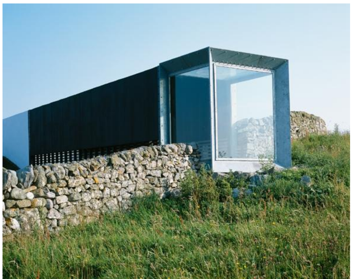
Figure 6 An Turas