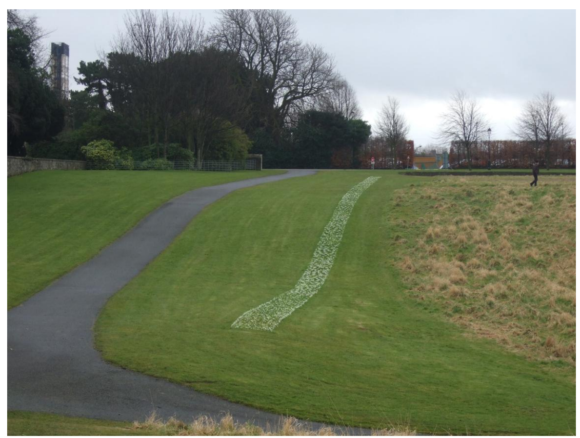
Figure 5 Recurring Line: North/South

Thinking about sound and about time, it just seemed quite logical that these swifts, and my experience of them, would make quite a good subject matter for the piece of work that I'm proposing for the Sounding Drawing project. That, if you like, explains the subject matter of swifts. Actually, the project is taking place about four weeks too late to be ideal because it would have been nice synchronicity to have my piece referencing the coming and going of swifts at the time when they were more or less leaving that landscape.